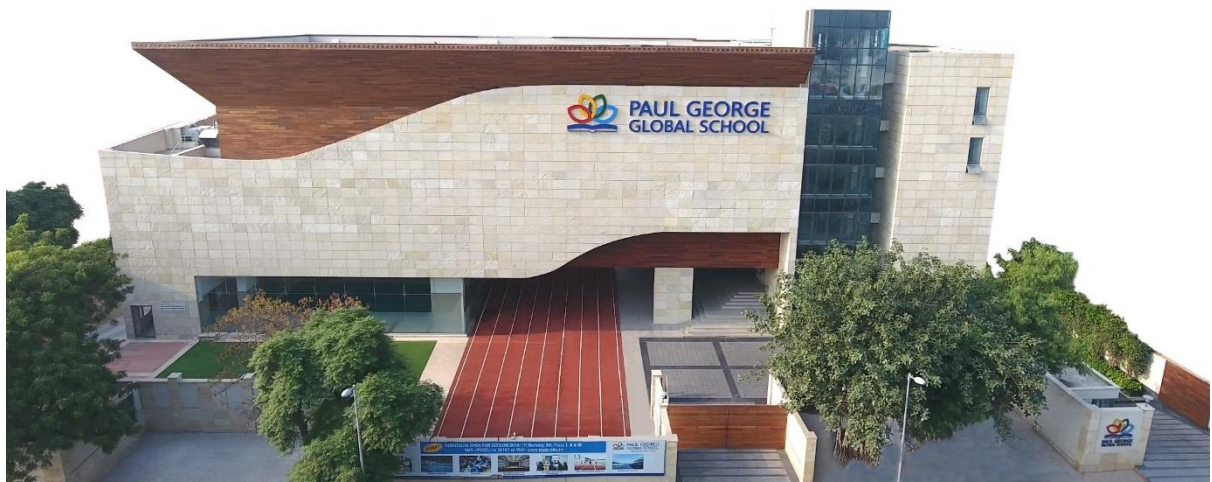
Paul George Global School

The project concentrates on St. George's School, New Delhi and Paul George Global School which is managed by St. George's educational society. These schools chosen to take on this project in light of the school's contribution to fostering educational excellence and the advantages it will bring the next generation. The company has approved Rs.16,63,37,872/- (Rupees Sixteen Crore Sixty-Three Lakh Thirty-Seven Thousand Eight Hundred And Seventy Two Only) for maintenance and running of the School's multipurpose lower floor, which is a gem in the School's crown.