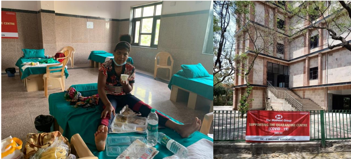
Setting up of a quarantine Centre in GK2, Delhi