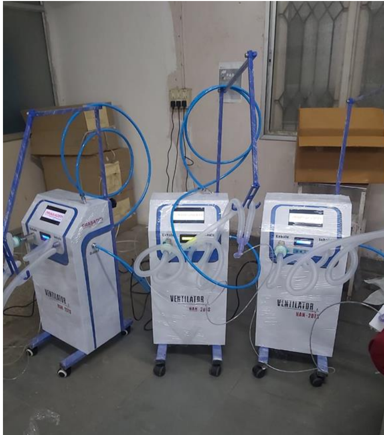
Ventilators to Covid Care Centre