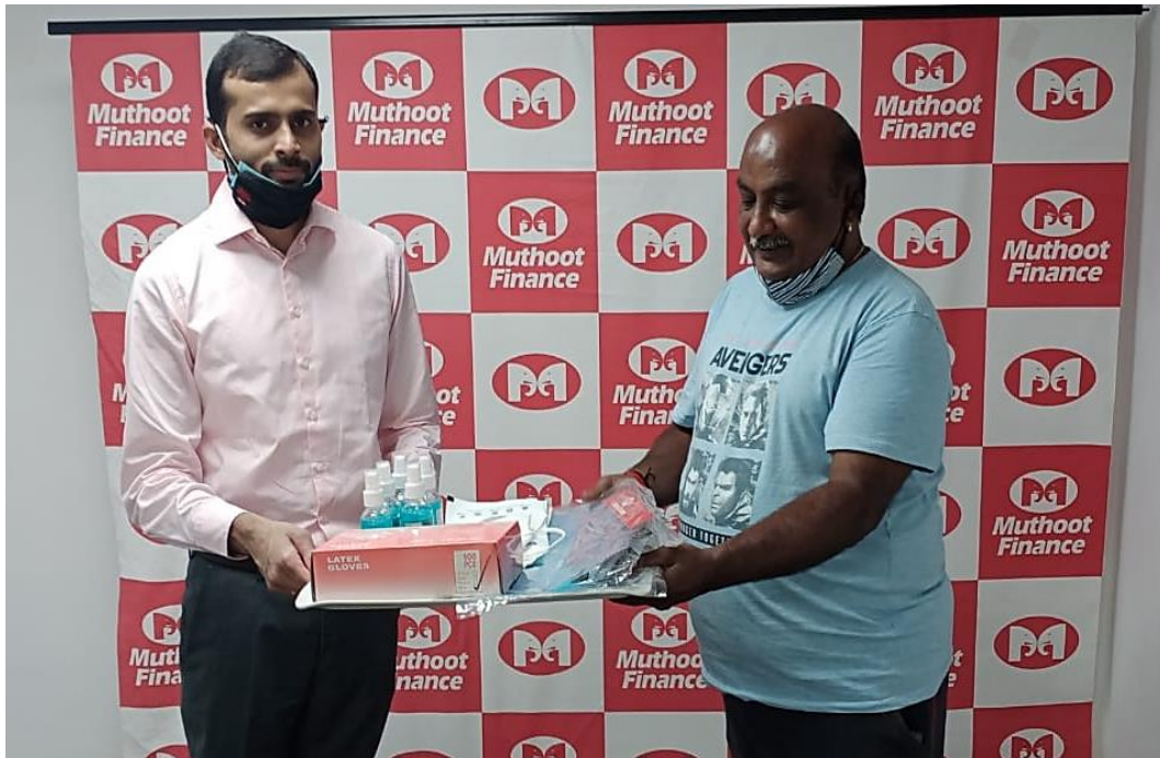
Items- Masks, Sanitizers, Gloves and Face Shields