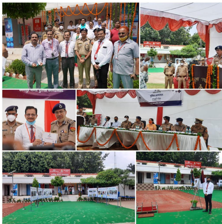
Sixteen Bedded Covid Police Hospital Kanpur